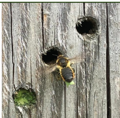
Leaf Cutter Bee There are a few different species of leaf cutters but look out for bees carrying little cut sections of leaf or garden plants. They stick the bits of leaf together to make nest cells for their young. The female don't have pollen hairs on their legs, but under the end of the abdomen.