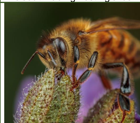
Honey Bee It's abdomen is quite long, and it can be all dark or have some more orangey segments nearer the thorax. They have hairy eyes and long legs which hang down when they fly.

White-tailed bumblebee - There is no picture for this one. It is very similar to the buff-tailed but the yellow bands are more of a lemon yellow and the white band on the tail has no buff edge.