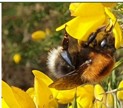
Tree Bumblebee, Queen This bee only came to the UK from Europe in 2009 and is now found as far north as Scotland. It's a distinctive bee, with an orange brown thorax and a black abdomen with a white tip. They often nest in trees and bird boxes.