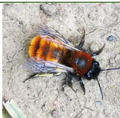
Tawny Mining Bee, Female The female is a lovely bright red-brown colour all over. They nest in the ground.