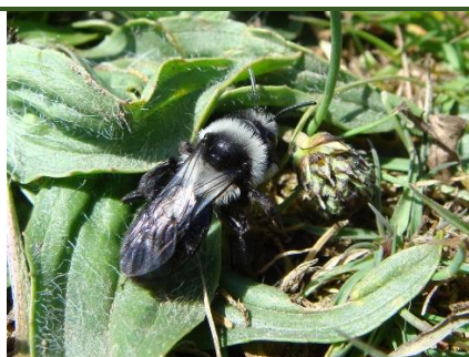
Ashy Mining Bee, Female One of the most common and distinctive solitary bees. A black and grey species which makes small burrows in sandy ground.