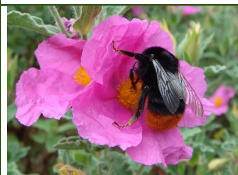
Red Tailed Bumblebee, Queen Nice and easy to identify, black with a red tail.