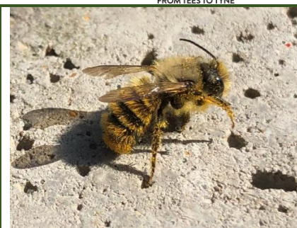
Red Mason Bee This is the most common mason bee which is often found in gardens. You may find it looking for nest holes between bricks, especially on the sunny side of your house or garden wall. Solitary bees like south facing nesting sites.