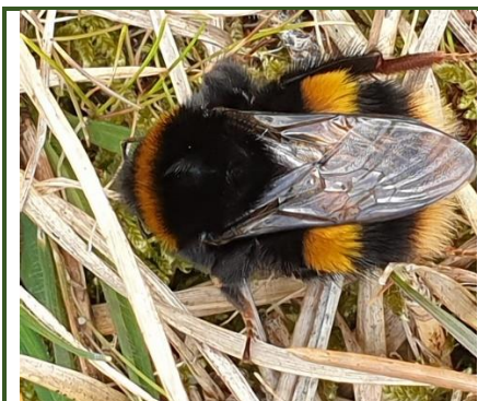
Buff-tailed Bumblebee, Queen This is probably the most common garden bumblebee in spring. The yellow bands are an orange/egg yellow, and the white band at the end of the tail (thorax) has a buff/soft edge to it.

All of the bumblebees pictured here are queens, males and workers (also female). They can have different colours but as queens are the ones we first see in spring (they have just come out from hibernation) we are going to keep it simple and focus on them.