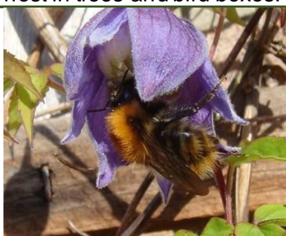
Common Carder Bumblebee, Queen It is brown all over but can be various shades of dark to yellow brown.