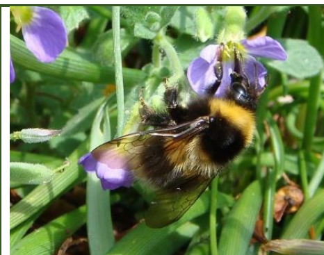
Garden Bumblebee, Queen It has a yellow band in the middle (end of thorax, top of abdomen). It also has a long face and tongue so it's good at feeding from deep flowers like foxgloves.