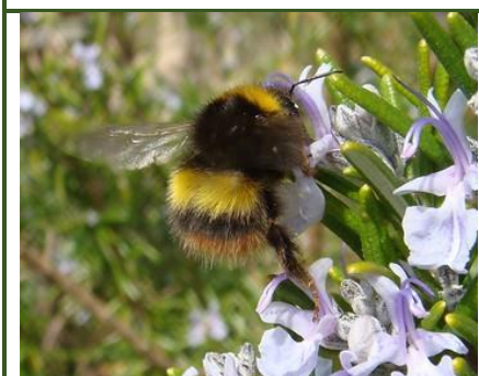
Early Bumblebee, Queen This is normally a smaller bee than the buff and white tailed bees. It has a very small orangey tip at the end of the abdomen.